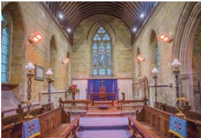
HN Halogen Heaters heating a church in Market Harborough