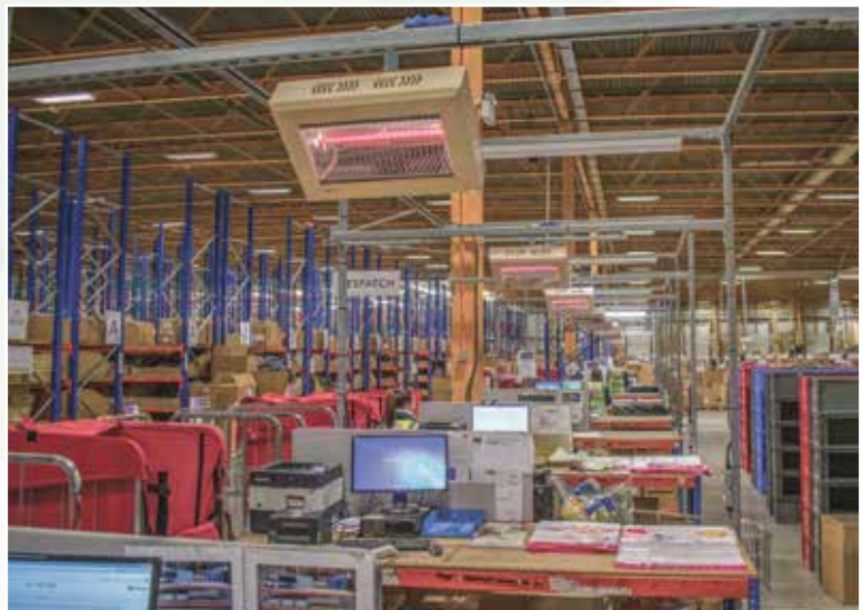
Each packing station has its own magic lamp 'zero glare' heater

All the performance of a conventional shortwave halogen heater but producing the gentlest pink glow and zero glare