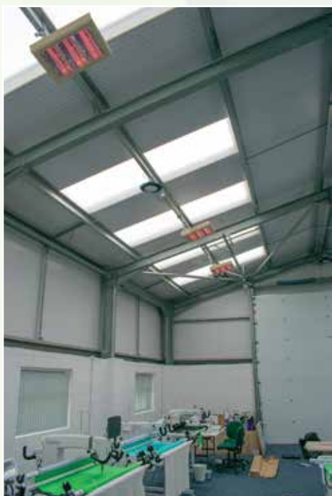
Three phase halogen heaters providing instant heat above industrial sewing machines