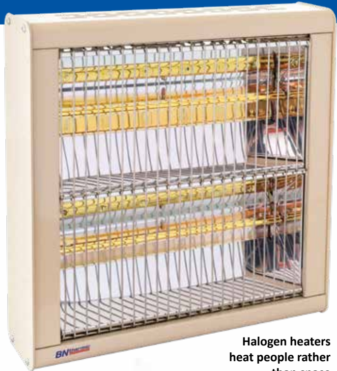
Halogen heaters heat people rather than space